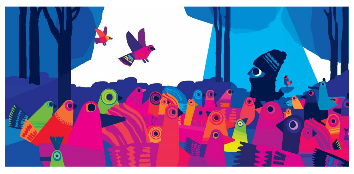
From Shh! We Have a Plan by Chris Haughton (Walker Books 2015)

Does the artist choose to use double page spreads, single page spreads or a combination of the two? How does the artist use framing and white space to open up or set scenes? Are frames deployed to move the narrative on or slow the narrative down? Does the positioning of character separate them from each other? What does this mean in the context of the story? Is white space used to separate, focusing our attention on a character's feelings or emotions or a particular incident that is taking place? Does the structure of the book, e.g. the page break or the page turn separate characters? What is the effect of this on the meaning of the story?