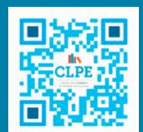
SCAN TO CONTACT AN ASSOCIATE SCHOOL

Our Associate Schools are always happy to talk to other schools about the implementation and impact the Power of Reading has made in their school.