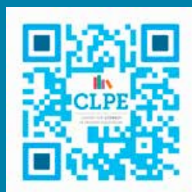
SCAN TO BOOK TRAINING

Online sessions are delivered over 8, interactive 2 hour webinars across an academic year.